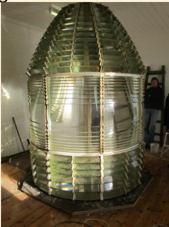
The original Cape Wickham Lighthouse Lens

Cape Wickham and Cape Otway on Victoria's South Coast formed the "eye of the needle" leading sailors into the narrow Bass Strait. After leaving the Cape of Good Hope in South Africa and crossing thousands of miles of sea navigators had to find their way into a strait less than 90 kilometres wide. The shores of King Island became the final resting place of many ships which faltered close to the end of their journey.